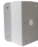
HLDS-1276ZJ Corner Mounting Bracket