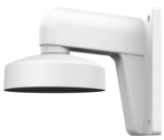
HLDS-1272ZJ-110 Wall Mounting Bracket