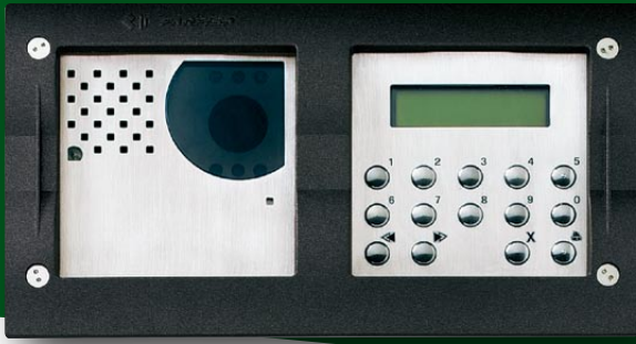
VIDEOINTERCOM COMPOSITION WITH DIGITAL CHIME