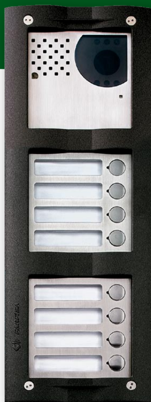
VIDEO INTERCOM COMPOSITION